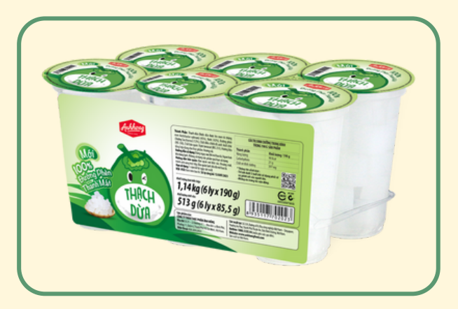
CUP 90G OR 190G Block = cup x 06