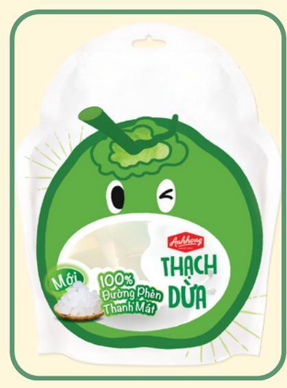
Default SKUs Bag of 400g Bag of 900g