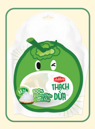
BAG 400G OR 900G